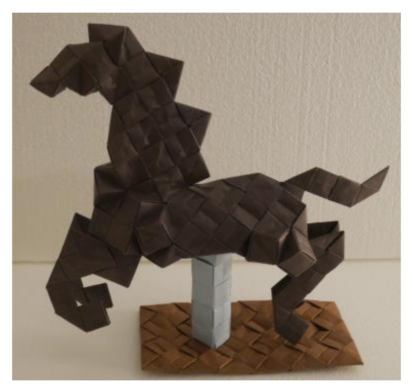
Figure 6: my pixel unit version of the Kasahara Sonobe horse.