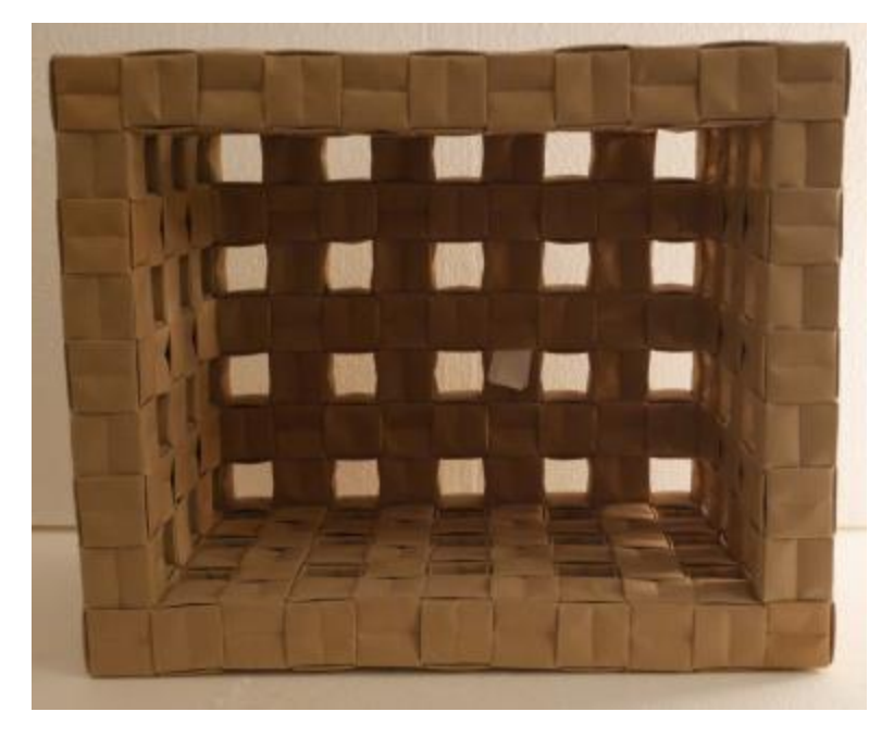
Figure 4: gasket crate (16.5 x 13.5 x 10.5 inches) I designed (white tag is for documentation).